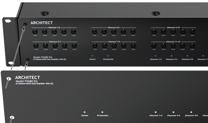
Model P2680 EQ and P2280 EQ feature 5 band EQ per zone (magnetic security cover included)