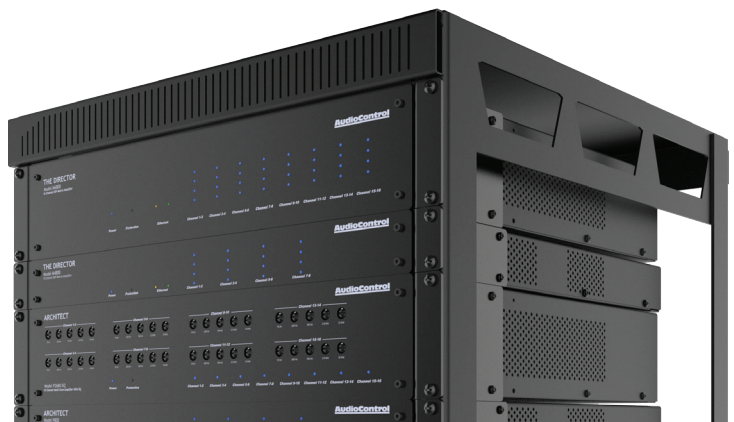
More Power. More Control. Less rack space.