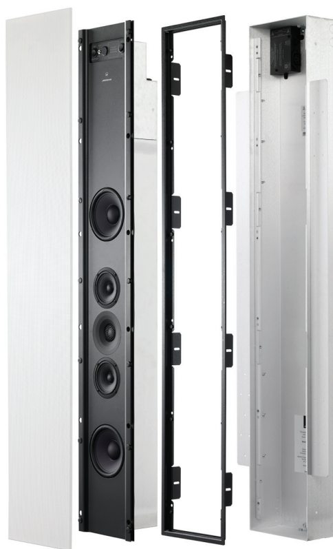
DSP750 shown with grille and RF600 rough-in box

The sealed aluminium cabinet design ensures that a reliable and repeatable performance is achieved regardless of the installation. High dynamic range, low distortion and an outstanding signal-to-noise ratio combine to provide full-range sound with exceptional headroom and low-listener fatigue in any room.